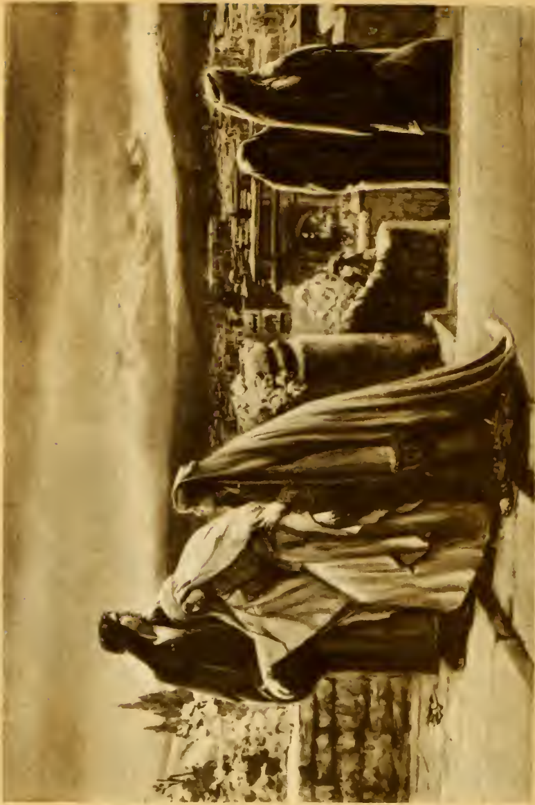
“And the Disciple took her to his own.”